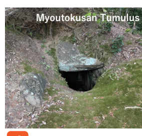
Approx. 2 hours